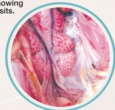
Kidneys showing urate deposits.