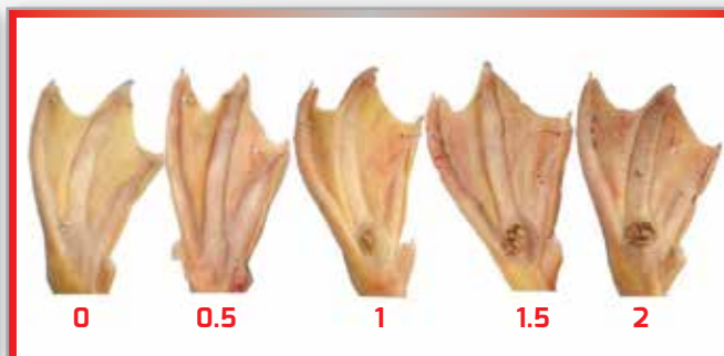
Web-toe hemorrhage score