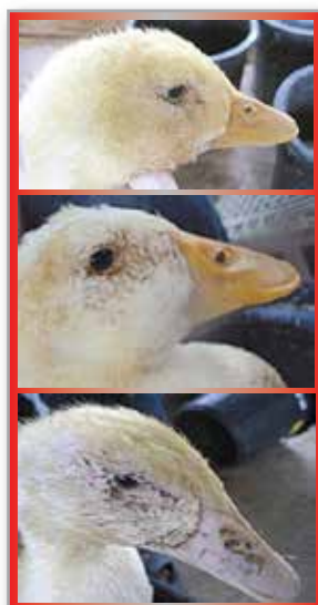
Eye necrosis score

a, b, c, d, e Means within a column without a common letter differ significantly ( P < 0.05 )