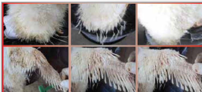
Feather growth score