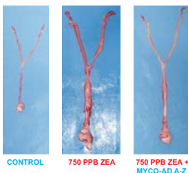
Figure 1. Relative internal reproductive organs weight of 54 day-old gilts exposed to experimental diets for 30 days.

a, b, c. Means within columns with no common superscripts differ significantly ( p \leq 0.05 )